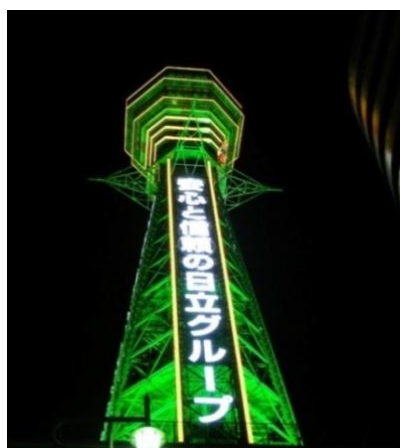
Osaka: Tsutenkaku Tower