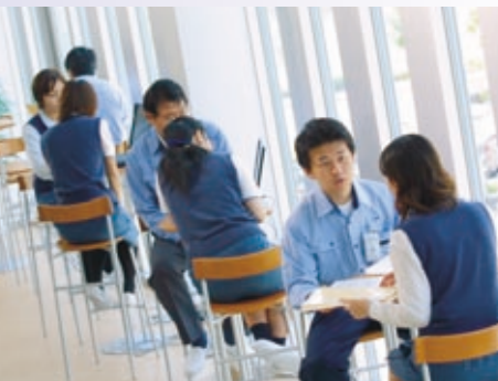
The Nara Research and Development Center, which was expanded to twice its previous size in 2002, features a unique "free address" system that allows researchers to select seats according to the needs of their jobs.

obtained through research into rheumatoid arthritis. Moreover, we have also developed our own drug delivery system (DDS) technologies for the efficient delivery and sustained release of active ingredients to affected areas in the posterior segment, and are now examining the possibility of applying these technologies to actual drug production. Presently, there are almost no effective treatments for retinal diseases, and therefore the development of a breakthrough, next-generation treatment will be extremely significant.