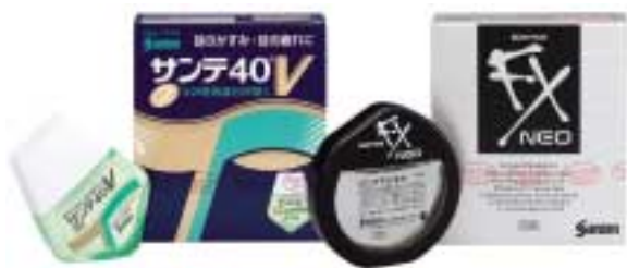
Sales of Over-The-Counter Pharmaceuticals