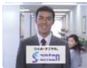
▲ New Sante 40 TV commercial launched in May 2004.