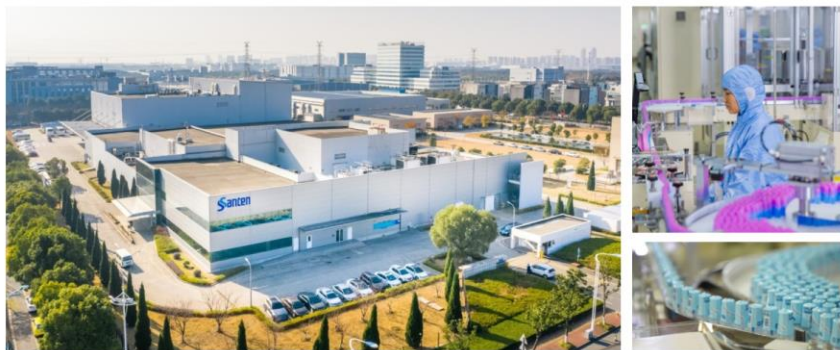
Our Suzhou First Plant in China